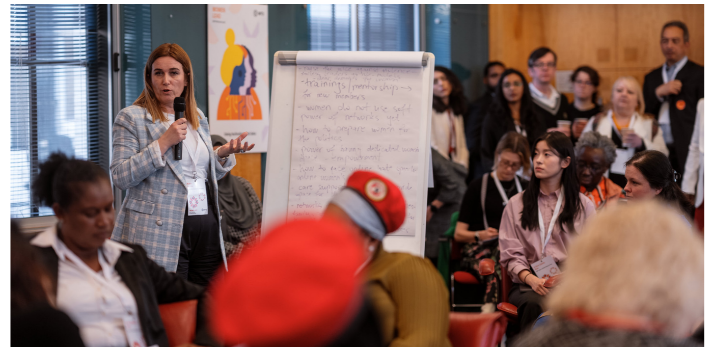
Picture below: Groups focused on specific themes and recommended concrete actions, which they presented to the conference.