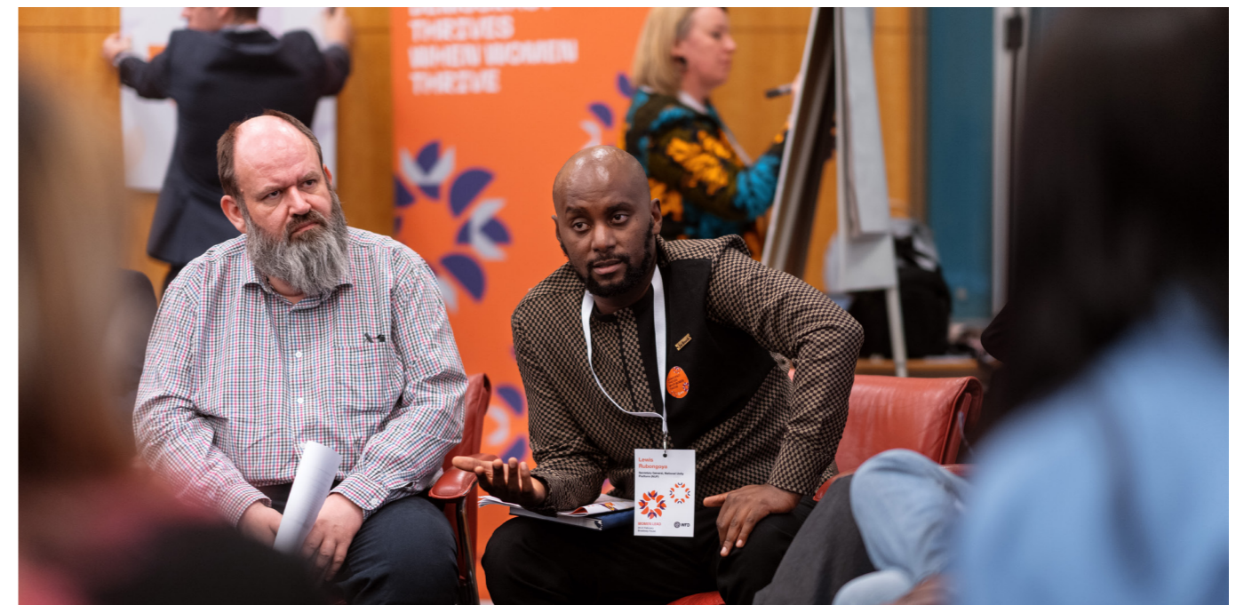
Picture below: Conference delegates heard perspectives from more than 20 countries, discussing shared challenges.