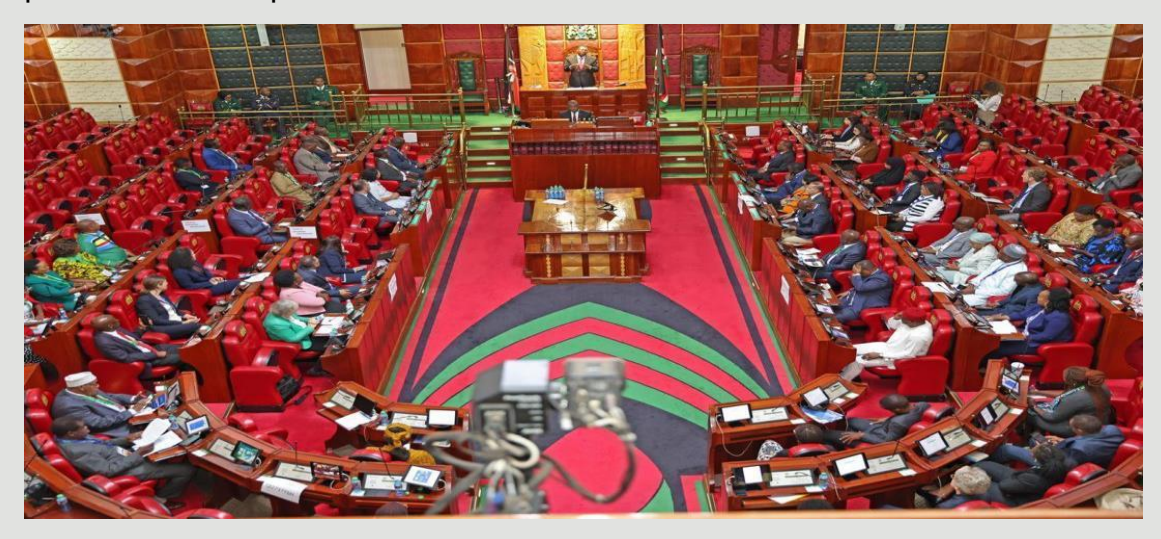
Image: Parliamentarians' dialogue at the Africa Climate Summit.

In the lead up to the ACS and the Parliamentary Dialogue the Kenyan Senate on 31 August 2023 passed the Climate Change (Amendment) Bill, 2023, to amongst others, provide a legal framework for carbon trading as a vital tool to achieve emissions reduction targets and to fulfil commitments outlined in international climate agreements. In the wake of the ACS, MPs championing climate change moved motions to table the outcome of the dialogue in their respective parliaments. International summits clearly serve as catalysts for parliaments to demonstrate their political leadership and commitment to climate action.