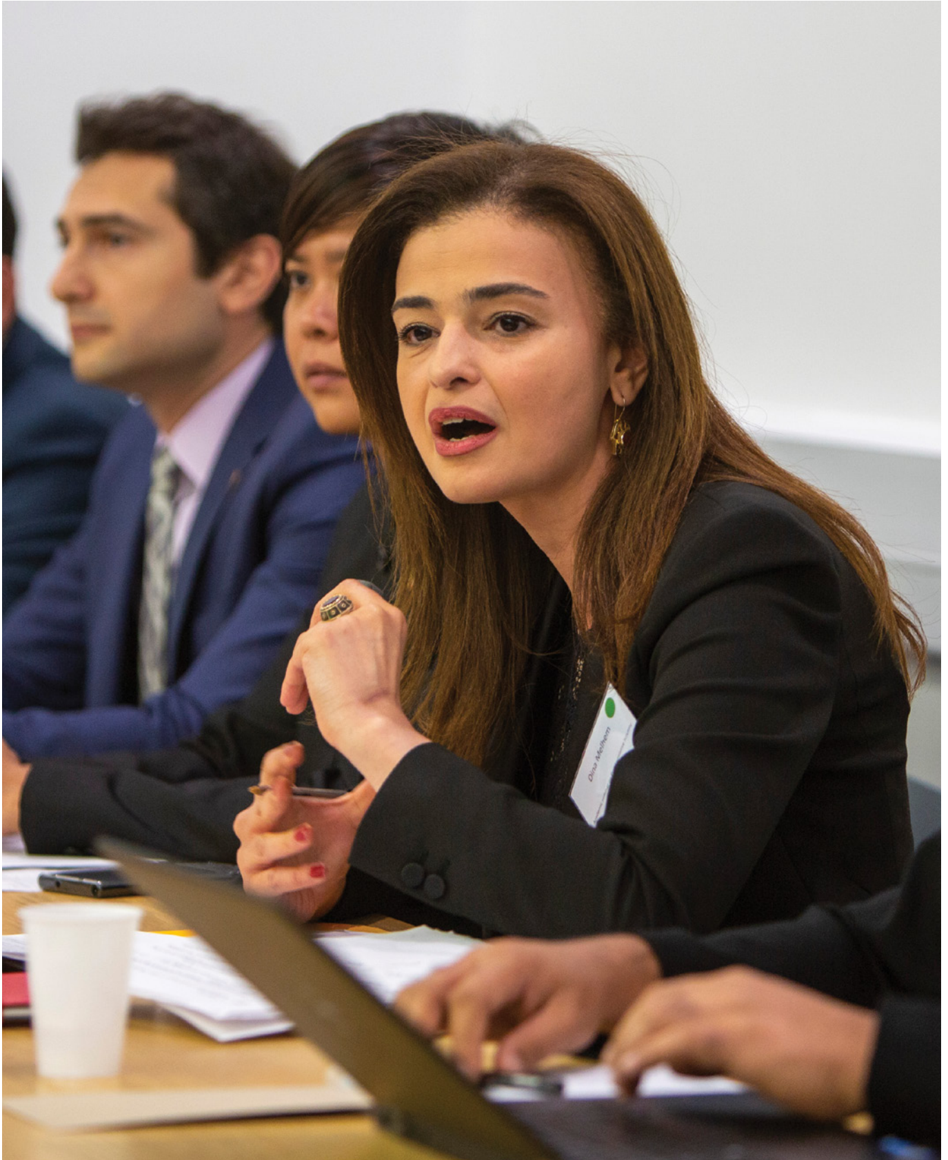
Photo 4: Accountability of independent oversight institutions and regulatory agencies means an obligation to explain, answer for, and bear the consequences of the way the institution or regulator has discharged duties, fulfilled functions and utilized its resources. We have designed an assessment framework covering five instruments for accountability, related to twenty indicators.