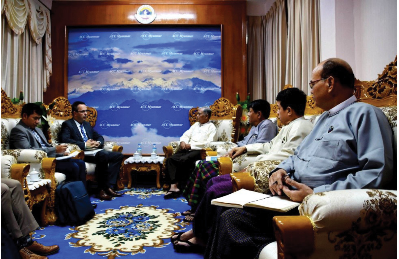
Photo 5: WFD meets the Chairperson of the Anti-Corruption Agency in Myanmar, anti-corruption agencies are central to an integrity system.