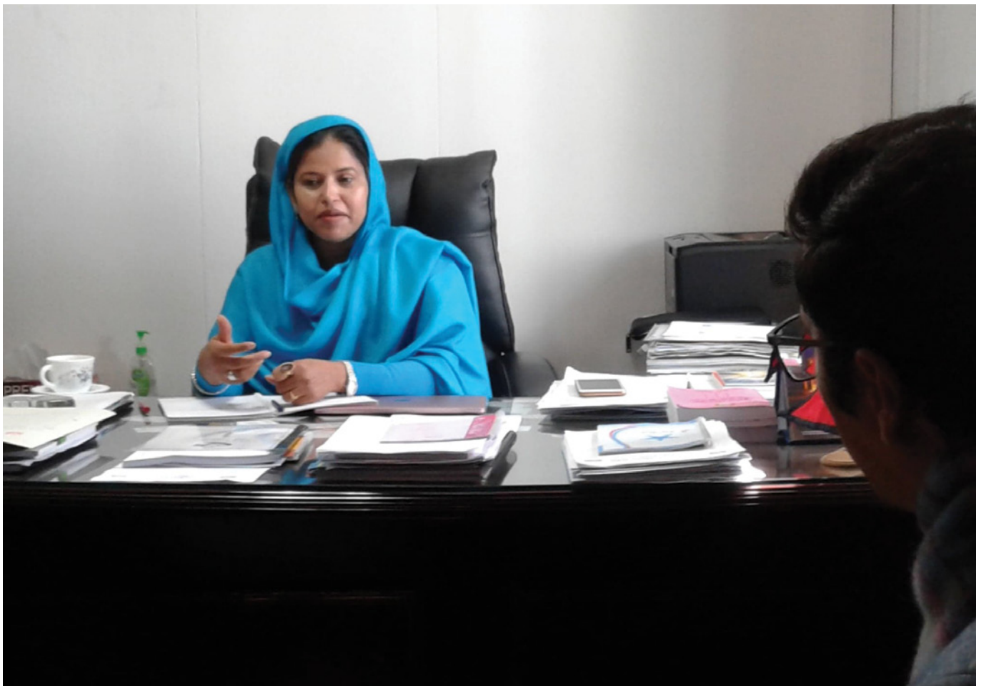
Photo 6: WFD meeting with the Human Rights Commission of Nepal. In many countries, Human Rights Commissions are one of the critically important Independent Oversight Institutions.