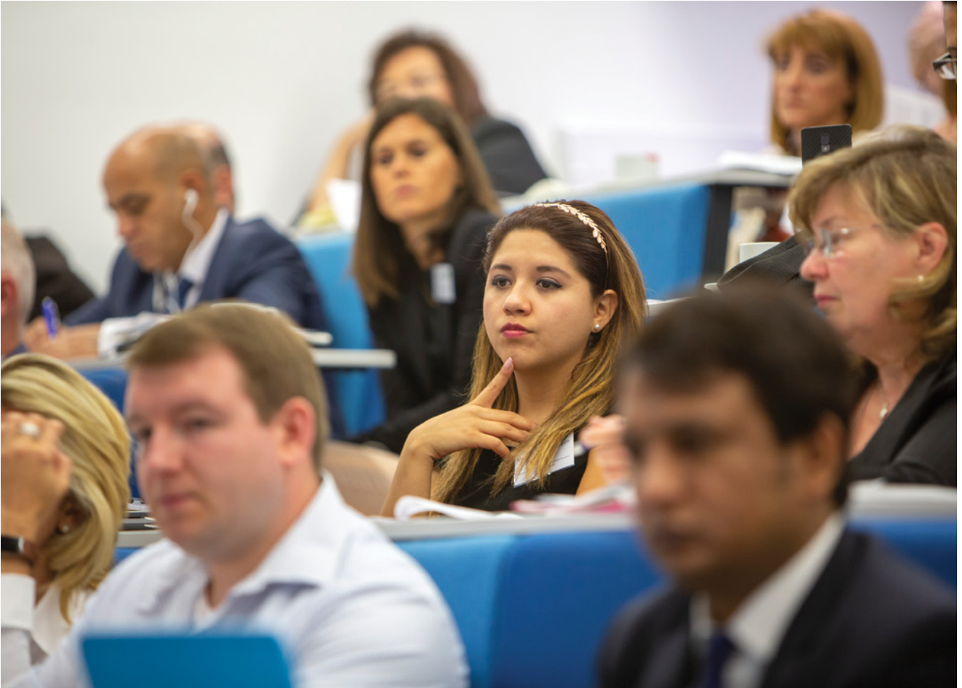
Photo 2: WFD is an example of a UK non-departmental public body, sponsored by the Foreign and Commonwealth Office.

Commission, and the Security Commissioner. Many have territorial counterparts in the devolved administrations.