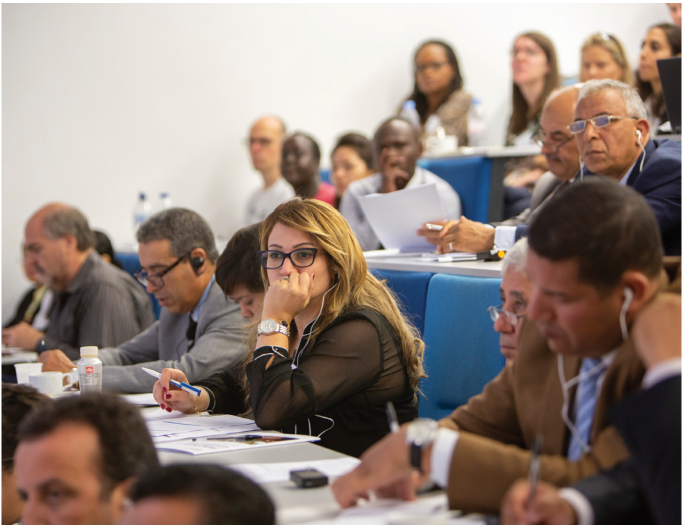
Photo 3: We have analysed what constitutes the independence of the institution or agency, and have designed an assessment framework covering four instruments for independence, related to twenty-three indicators.

In this section of the paper, we will analyse what constitutes the independence of the institution or agency. We have designed an assessment framework covering 4 instruments for independence, related to 23 indicators. The instruments and indicators for the accountability will be discussed in the next chapter.