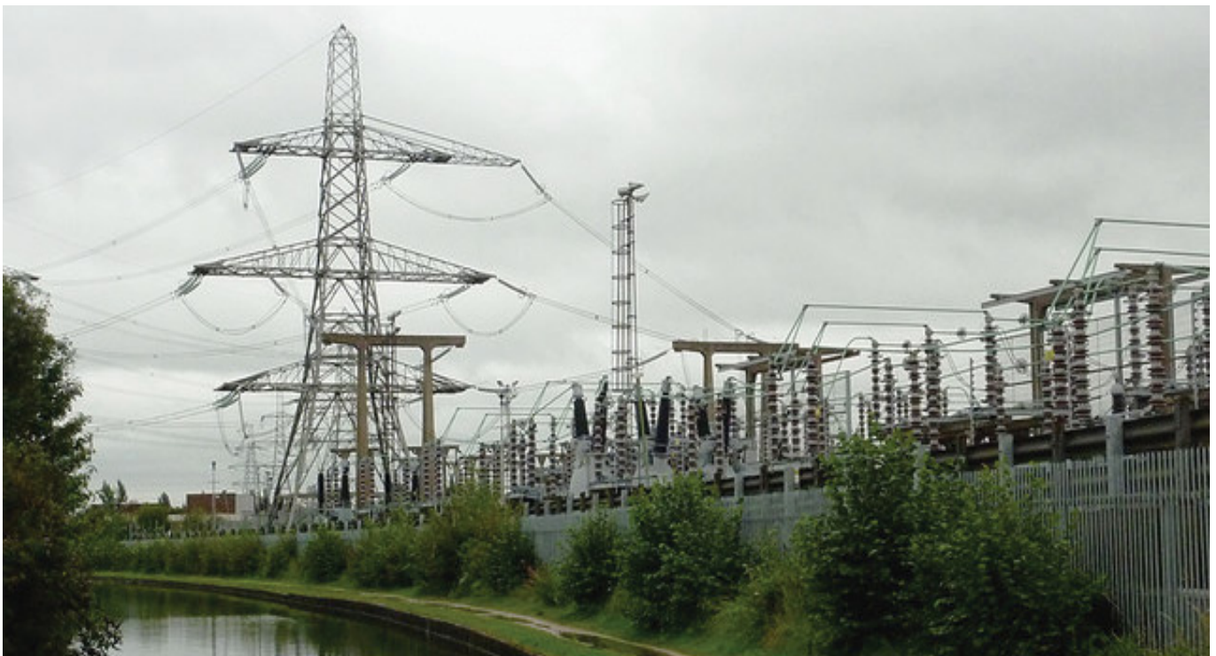
Photo 1: Regulatory agencies can monitor a variety of services for consumers, including energy. Ofgem is the United Kingdoms energy regulation agency.

Secondly, this paper enables to review parliaments' relationship with the institutions and agencies. In achieving the level of independence and accountability, one can determine if parliament has a leading role, supportive role or weak/no role for each of the indicators. This will then enable to measure the strength of parliament's interaction with each of the institutions in a more objective way.